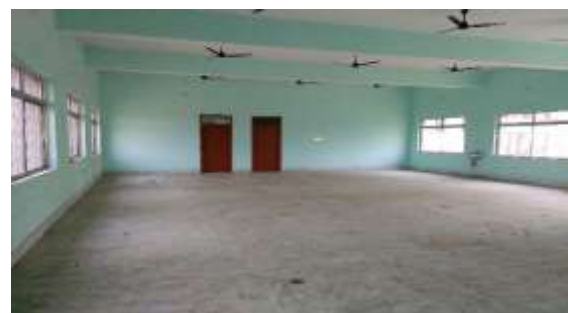
Wide hall space