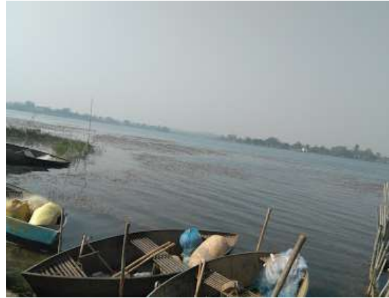
Boats near barrage