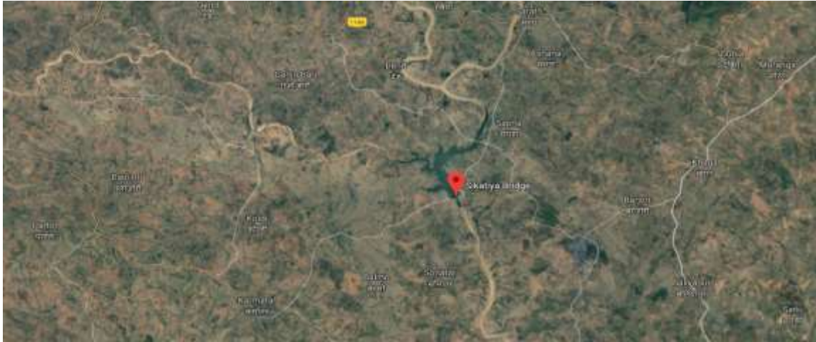
Figure 1: Property location

Way Side Amenities, Hamsada is located on NH-18 highway. Nearest Bus Station is Mango Bus Station, Jamshedpur.