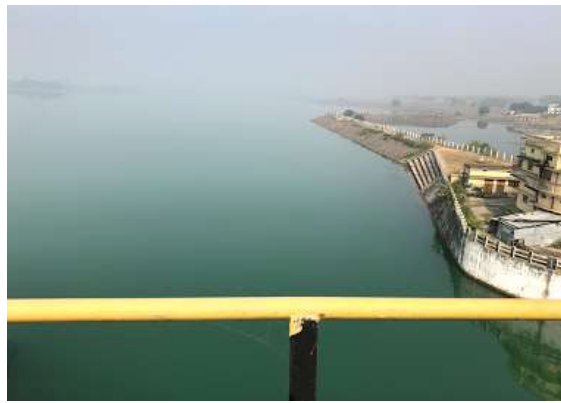
View from barrage