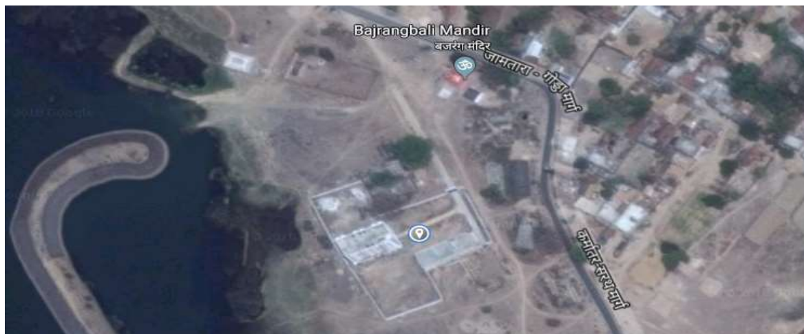
Figure 2: Tourist Complex, Sikatiya

The property is surrounded by major tourist attractions and social connects, especially a water body. Due to this, there is a footfall of tourists around the property in peak seasons and weekends. However, the property is still in non-operational mode and requires basic investments viz. television sets; surveillance cameras, provision of air conditioners, restaurant setup, purchase of beds and cots, manpower mobilisation (Cook, staffs etc.,) and other upgradation of infra works.