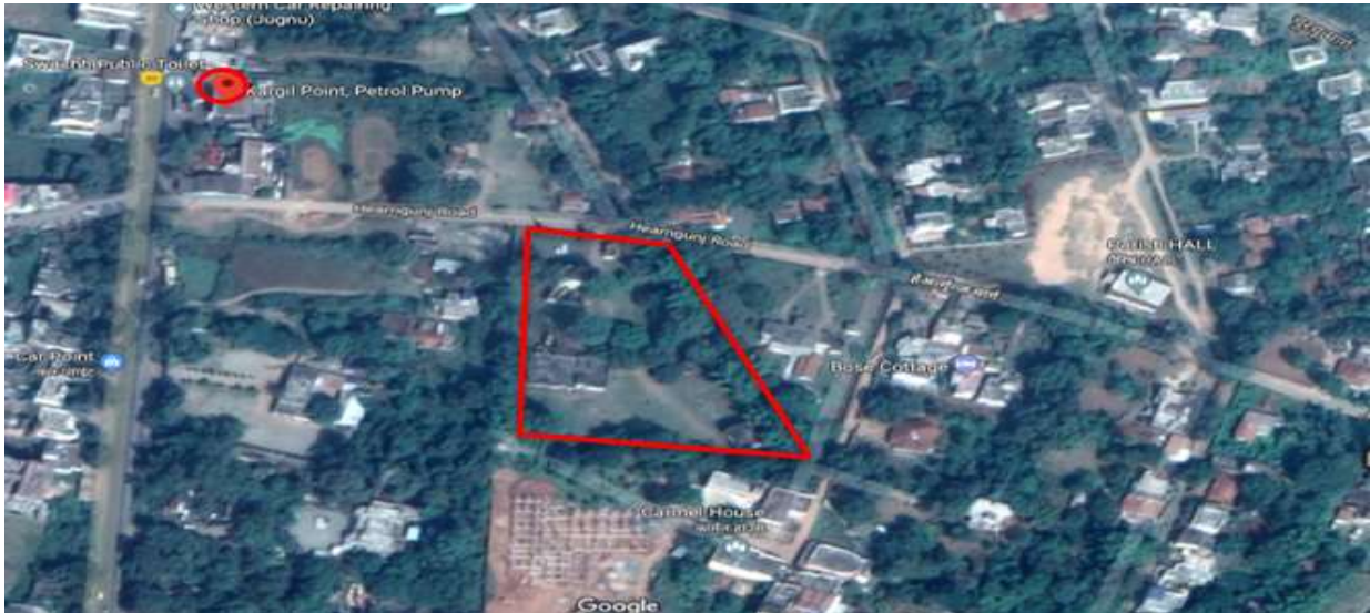
Figure 1: Property location