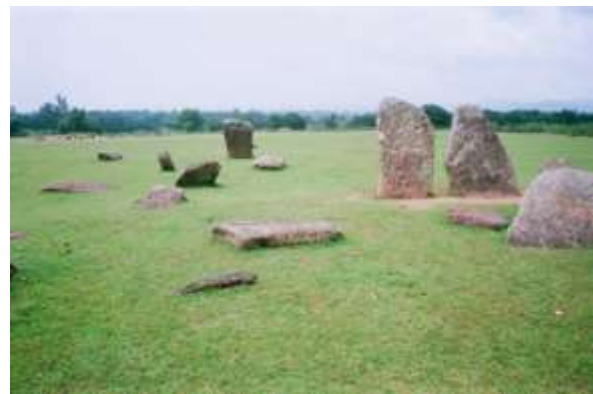
Megaliths of Hazaribagh