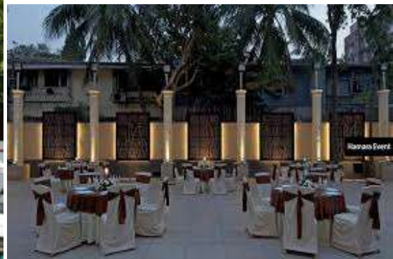
Open Banquet Space