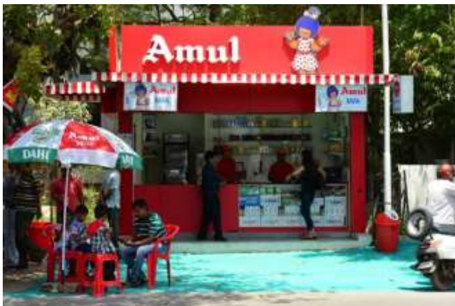
Ice Cream Kiosk