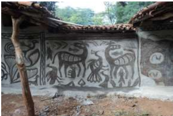
Sanskriti Museum and Art Gallery