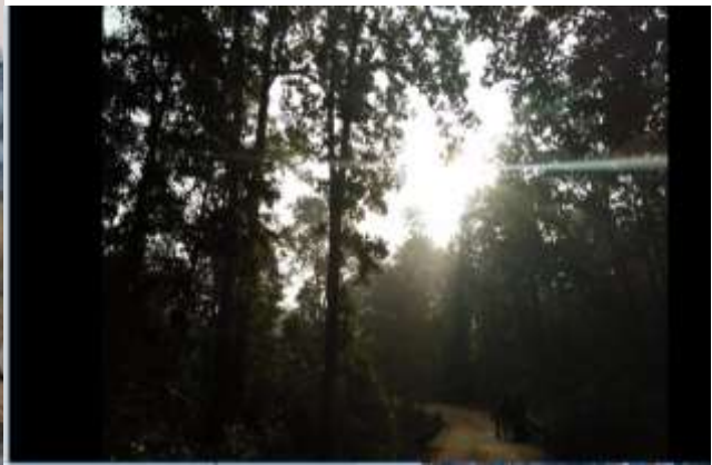
Hazaribagh Wildlife Sanctuary