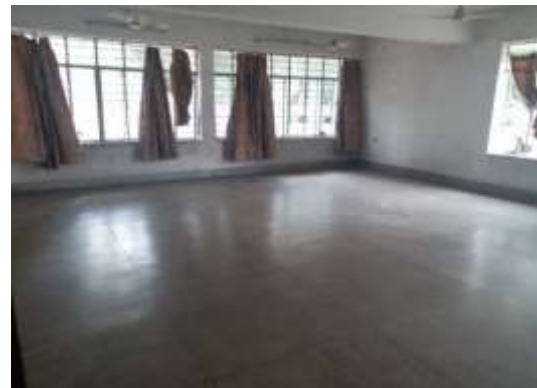
Space for restaurant