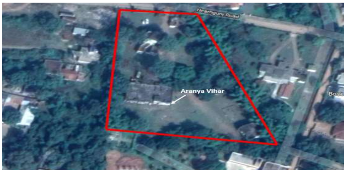
Figure 2: Aranya Vihar, Hazaribagh

Hazaribagh Indoor stadium is situated at distance of 2km from the property. Apart from this, various tourist attractions which include Hazaribagh lake, Urban Hat, Rajrappa temple, Canary hill and other social spots. Another important tourist attraction is Megaliths of Hazaribagh; on every 21 st March and 23 rd September, many villagers, tourists and researchers visit this place to observe the Equinoxes. The observation takes place for 30 minutes. It is also known to offer great views of the sunrise and sunset throughout the annual Solstices Lake. However, the property requires substantial investments including renovation works for main building, rooms and kitchen. The staff complex needs major renovation.